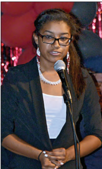
For the question and answer portion, the contestants dressed in "business casual" this year.