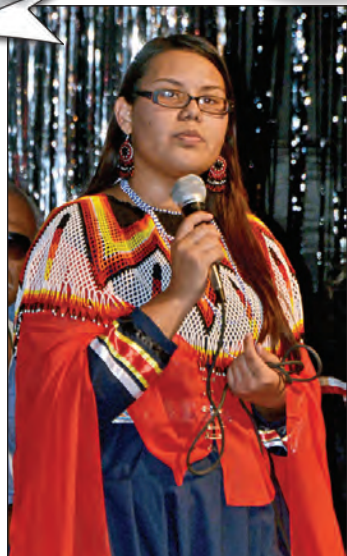
Each contestant gave an excellent introductory speech on their background and education.