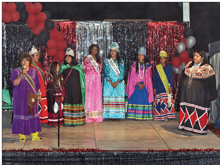
Visiting Tribal royalty included representatives from the Pi and Cocopah Tribes, plus Miss Colorado River Indian Tribes and the San Pasqual Middle School and Elementary Princesses.