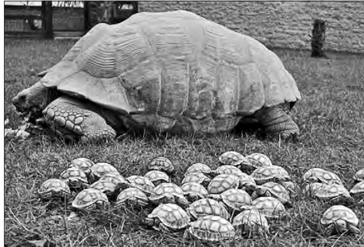
Yes, they're cute now, but African Sulcata Tortoises can grow up to three feet long, weigh up to 200 lbs, and live for 150 years.

Prickly pear cactus pads, hibiscus leaves, hay from various grasses, and dandelions are generally safe. Some common