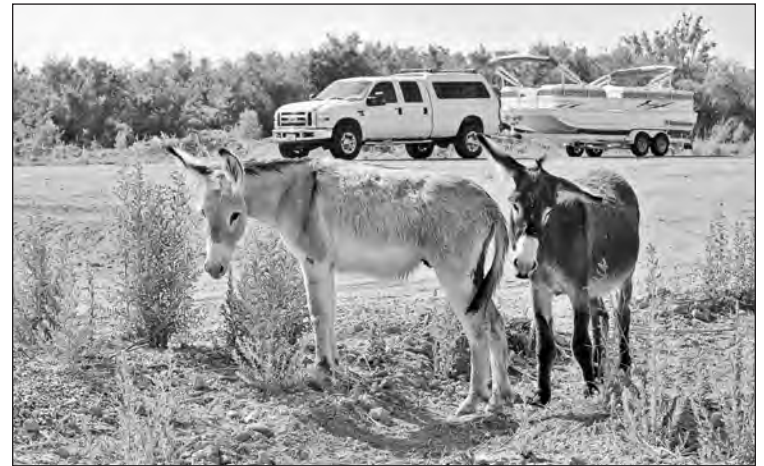
Constant traffic along California S24 adds to the danger, especially when people pull over in areas with limited sightlines to pet and feed the feral animals, a violation of federal game laws. Q NEWS Photo: William Isbell

Burros living in the scrub along the banks of the Colorado River at the east edge of the reservation around the Laguna Dam and Riverfront Trailer Parks have gotten used to receiving handouts from both drivers traveling along the road, and from some of the residents living at the parks. As a result, the burros have lost their normal fear of both humans and traffic. Someday soon, someone is going to be zipping along the road and find a burro standing