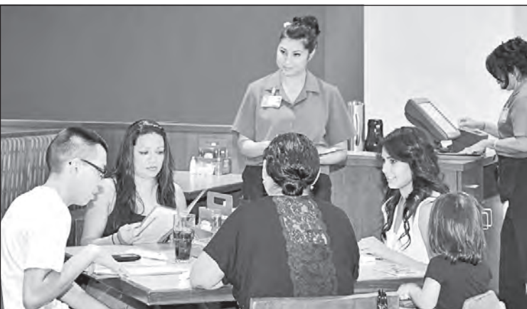
The Ocotillo Café changed from a buffet style restaurant to a full service family oriented restaurant on November 1st.

One of the busiest restaurants in the Quechan Casino Resort has changed up their menu and the way they serve their clientele, as the Ocotillo Café closed off their buffet line and switched over to a full service, family style eatery at the start of November.