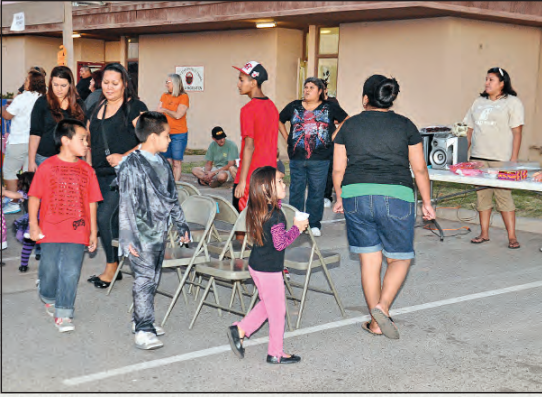
Dozens of carnival games were played at booths on the midway, including bouncing a ball into a witches cauldron (manned by the Special Diabetes Project for Indians, at left above) and a baked goods Musical Cakewalk run by the ladies from the Quechan Education Complex (at right above).