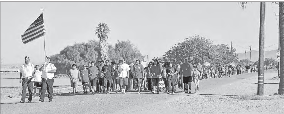
The entire student body of all of the San Pasqual Valley Schools (above, left) followed the Quechan Post 802 color guard and the Strong Hearts Native Society Pipa Singers down Baseline Road south to the high school football field for a Tuesday morning assembly, kicking off Red Ribbon Week. Once at the field, the Associated Student Body (ASB) officers for the Elementary School led their fellow students to the stand, carrying a banner emblazoned with the school mascot (above, right).