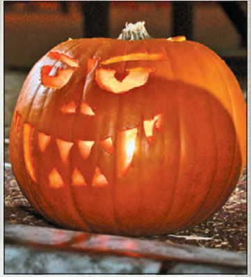
While Charles Rea carved the second place pumpkin, featuring Vampire fangs!