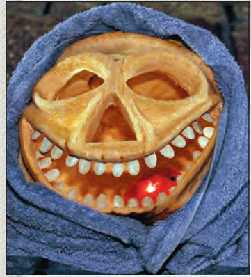
Billy Rea carved the winning Jack-O-Lantern this year, with pumpkin seeds for teeth!