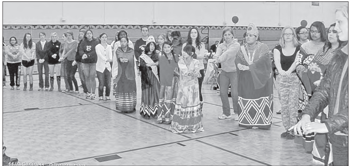
Once the work was completed, the volunteers joined the San Pasqual Strong Hearts Native Royalty and other local dancers, learning a few steps at the annual Quechan Cultural Festival.

The Ninth Annual Youth Cultural Festival saw 46 college students visit our reservation from November 4th to the 6th, participating in a weekend of culture awareness, work service, camping, and fun.