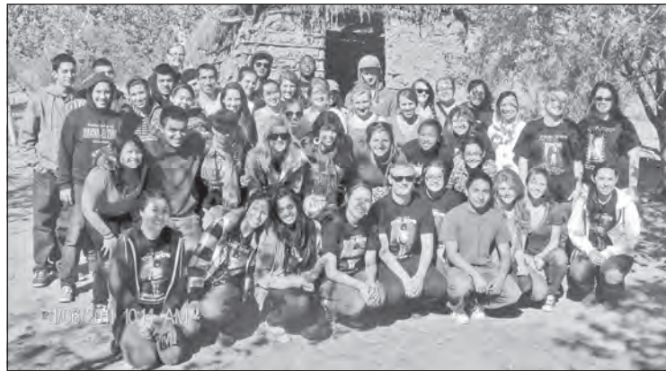
Student volunteers gather at the Elder Village for a group portrait after completing their work. The satisfied looks on their faces show how much they enjoyed their visit to Fort Yuma, land of the Kwat'san.

On Sunday morning the students were fed a hot breakfast by the Elder Village Focus Group and taken on a walking tour of the park, the Elder Village, and the North Channel Slough and Ag Conversion