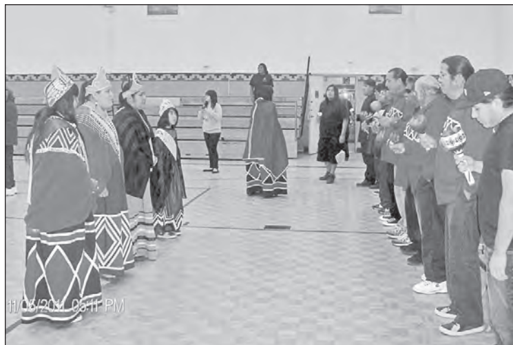
The Strong Hearts native royalty line up across from the Roadrunner Singers, as the Strong Hearts Pipa Singers gather alongside in preparation for the 9th Annual Youth Cultural Festival.