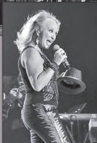
QUECHAN NEWS

Country great Tanya Tucker brought her career retrospective to the Quechan Casino Resort on October 28th, singing a compilation of her greatest hits to an appreciative packed room in the Pipa Event Center.