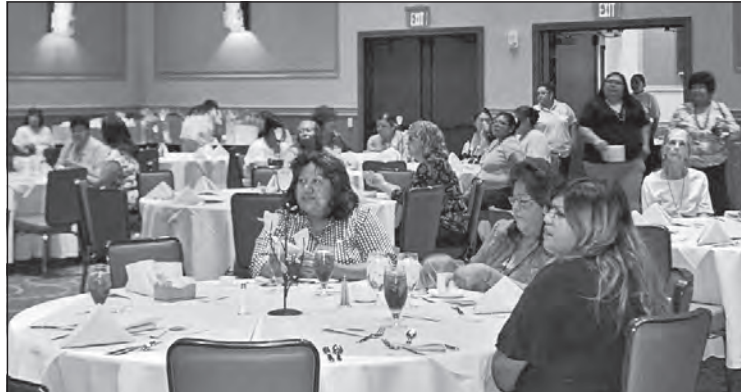
Tribal members and other guests took time to attend the Cancer Awareness Seminar at the Pipa Event Center and receive health education from both information booths and speakers.