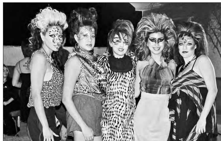
With a theme of "Capture Your Inner Animal" , the clothing, hair and makeup for the show to benefit Amberly's Place got pretty wild!