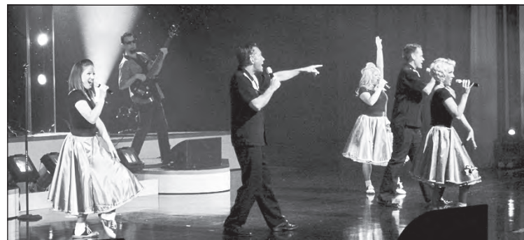
The entire 5 days was taken up enjoying the great variety of the entertainment options Branson has to offer.

The elders also saw the Baldknobbers Jamboree at Silver Dollar City and enjoyed dinner and a show onboard the Branson Belle, cruising beautiful Table Rock Lake before returning home on Monday, October 19th.