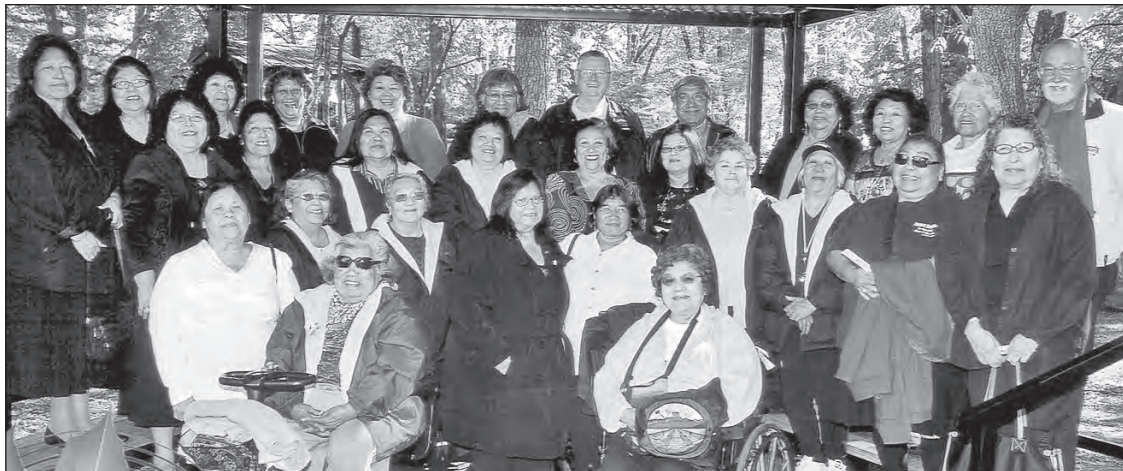
The Quechan elders sat for a group photo prior to boarding the "Branson Belle" for a dinner show and cruise aboard the Branson Belle paddlewheel steamboat.