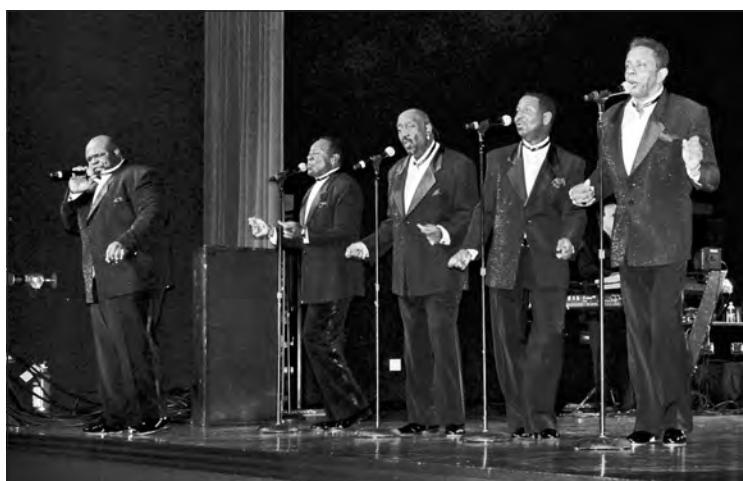
Motown's long lasting singing group kept the crowd dancing in the aisles during their October 4th concert.

Comedy great Ron White from the Blue Collar Comedy tour will be appearing at the QCR Event Center on November 22. Known as "Tater Salad", he's rarely seen without a drink in one hand and a smoke in the other, as he expounds his philosophy that "You Can't Fix Stupid!" Ron has played to sold-out audiences all