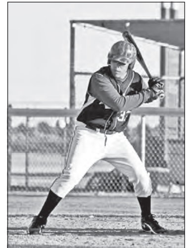
Baseball or football? Wrestling or track? The San Pasqual Unified School District faces tough decisions under pressure from the state's budget woes.

Each survey has been custom designed to fit the curriculum and expected activities for each school; elementary middle