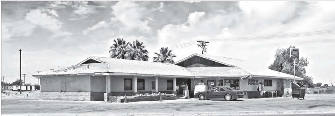
Take a good, long look: The original Pipa Market will soon be gone, to make way for a new Indian Health Service Clinic to be built in the same location.

Construction continues on the old Senior Nutrition Building, as the conversion continues for its new tenants: Pipa Market and the Quechan Barbershop.