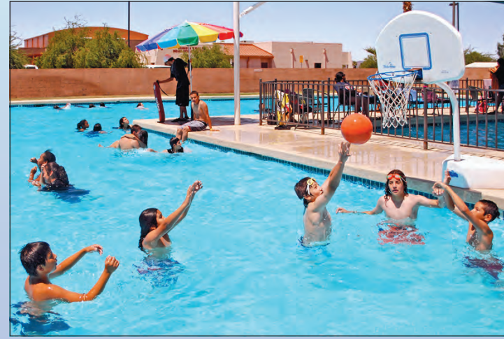
The pool-side basketball net also got more than it's fair share of action, with a game of hoops that rotated players going at it all afternoon. It seems as if every kid there in fourth, fifth and sixth grade took turns shooting and blocking the ball and performing spectacular leaps and saves - after all, the water in the pool is a lot softer than the gym floor, so more risks can be taken!