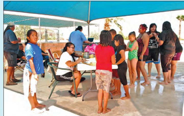
Splash day always features lots of great giveaways for everyone, regardless of age. Adults and kids lined up for their free raffle tickets, and listened through out the day for announcements of the winning numbers. Their were towels, water toys and even MP3 players awarded for both boys and girls - mom and dad, too!