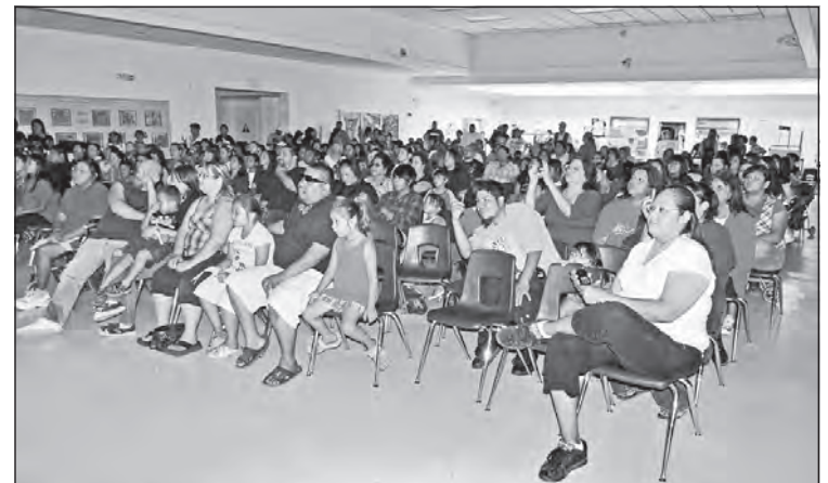
Parents and family members filled the cafeteria and laughed in all the right places, taking pictures of their little ones as they appeared on stage.