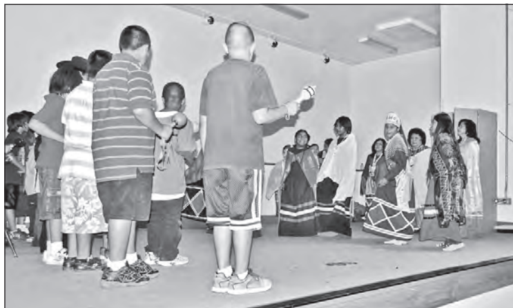
The elementary and middle school boys and girls formed a "Pi Pah Singers" group to demonstrate traditional music and dance.