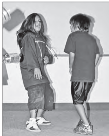
Young boys hopping to the gourd songs got the crowd cheering.