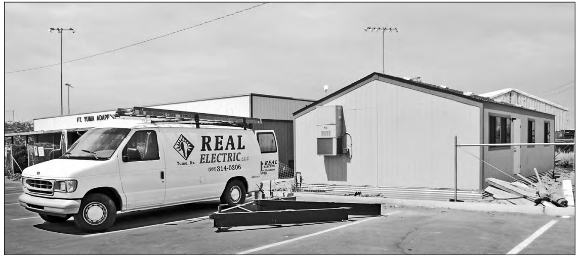
The new building is just to the south of the ADAPP main building, and contains office space for three counselors as well as a conference room for group sessions. QUECHAN NEWS Photo by William Isbell

It was delivered shortly before Memorial Day, and crews spent the next couple of weeks plumbing it into the existing water lines, adding it to the ADAPP electrical grid and closing in the crawl space underneath. Ventilation ducts and a sidewalk were then installed, and now some of the staff are eagerly anticipating getting into their own offices.