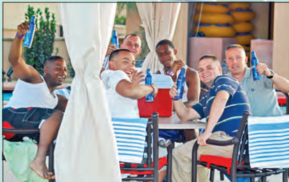
These Marines from Cherry Point, N.C. really seemed to enjoy themselves - they danced all night!