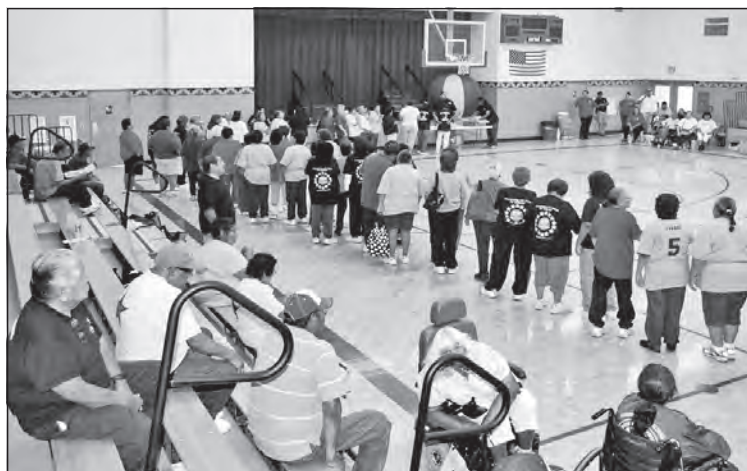
Every game station had a long line of potential contestants waiting their turns to step forward and give it their best shot. Here you see people queuing up to literally "try their hand" at the newspaper crunch.

Friday was reserved for the presentation of medals of achievement for the top three athletes in every age group, for each individual event. This year, the Awards Banquet was held at the new Quechan Casino Resort in the Pipa Event Center, giving many of the visiting seniors their first look at the new facility. And with all of the top contestants from each event in each age bracket recognized during the ceremony, it's no wonder that portion of the program took four hours!