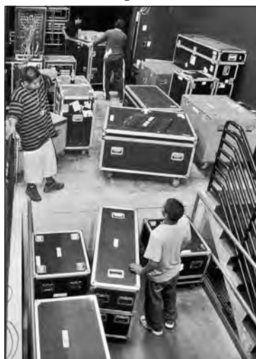
Just a few of the items waiting to go on stage are seen here!

The group had designed the show for large-scale arenas,