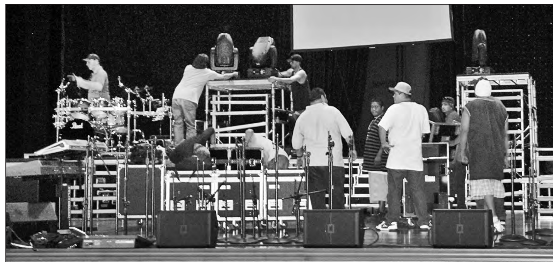
With only half the Quechan workers and a couple of the bands road crew visible, you can get some idea of the complexity involved in a show like this with the stage set up just beginning to go together!