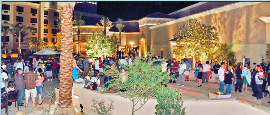
This view from a bridge over the lazy river gives some idea of the crowd who came out for the first Aqua Party. Bear in mind that you only see about a third of the area around the family pool in this shot!