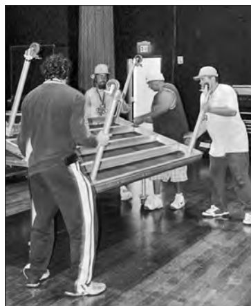
Everything had to be carefully placed in the correct order.

so they had more than enough equipment on board their trucks to fill the Pipa with light and sound after pulling in from the previous night's show at the Anaheim Convention Center.