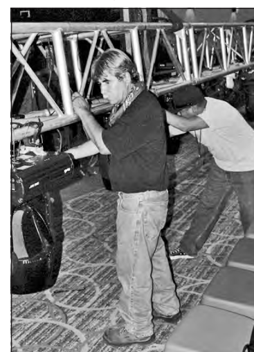
Extra lights had to be "flown" from the rafters in front of the stage.