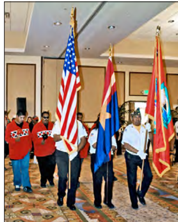
The Quechan Post 802 color guard lead the Roadrunners and Spirit Runners in to begin the evenings program.