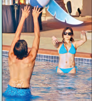
It's all just an excuse to meet new friends and have a little good, clean fun together!