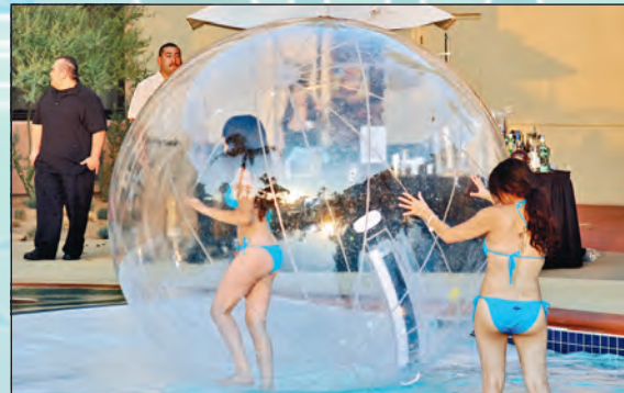
A clear inflatable bubble provided the Q Girls dancers a lot of exercise in just trying to walk upright on water!