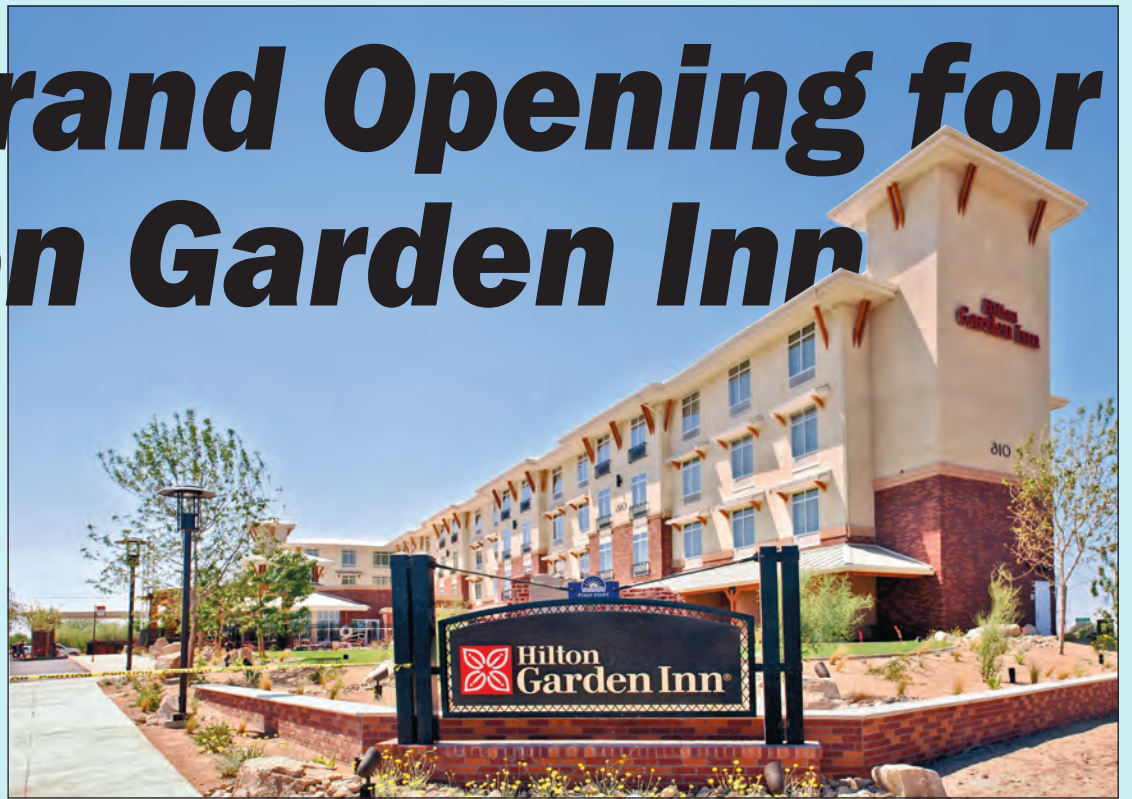
The Hilton Garden Inn is the centerpiece of the Yuma Pivot Point development, which finds the Quechan Tribe partnering with the C. W. Clark Development company to revitalize an important area of historic downtown Yuma adjacent to the Quartermaster Depot.

The four-story Inn features guestrooms and suites offering the Garden Sleep System® bed; complimentary wired and Wi-Fi high speed Internet access and 37" high definition flat screen