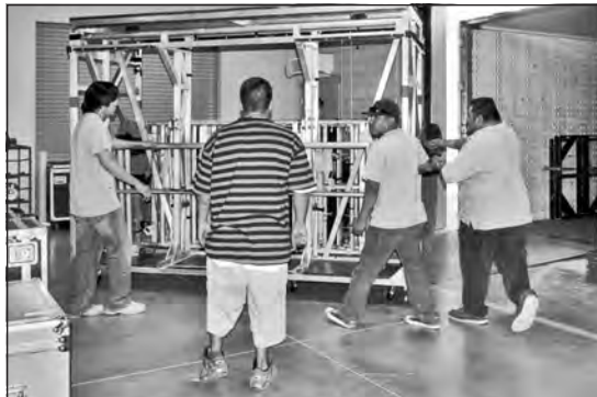
The workers first had to unload subwoofers and lighting trusses for the band, then maneuver dozens of huge "road cases" full of lights, instruments and sound equipment down the hallways to the rear of the stage. The stage platforms and rigging were brought into a special elevator platform and lifted onto the stage.