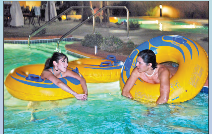
The casual atmosphere around the pool makes it a great place to relax and get to know someone new.