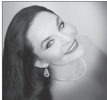
Two of the 40 greatest women in country music, Tanya Tucker and Crystal Gayle will both appear one week apart on October 28 and November 4 at the Pipa Event Center.

The Quechan Casino Resort has announced the first nationally known artists to appear for their fall concert season: country music artist Tanya Tucker will perform at the Pipa Events Center on Thursday, October 28, followed by Crystal Gayle one week later on November 4.