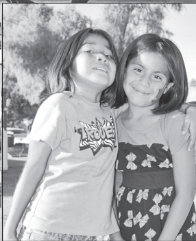
The foot race winners for the various age