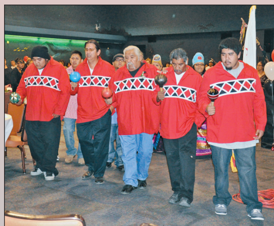
The Grand Entry at the start of the Pageant was lead by the Quechan Post 802 Color Guard and the Spirit Runners, followed closely by the Roadrunners singing group (seen above). All of the the visiting royalty and local dancers followed behind as the Roadrunners provided the music.