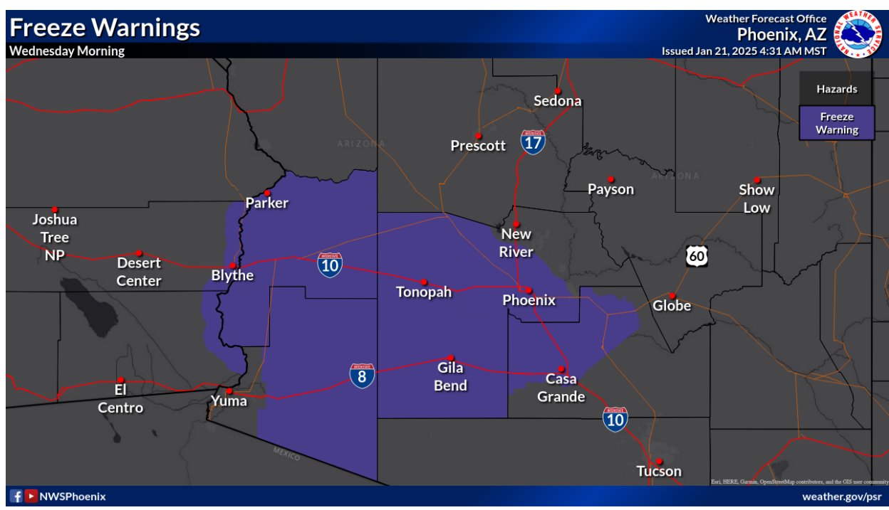
Freeze Warnings - Wednesday Morning