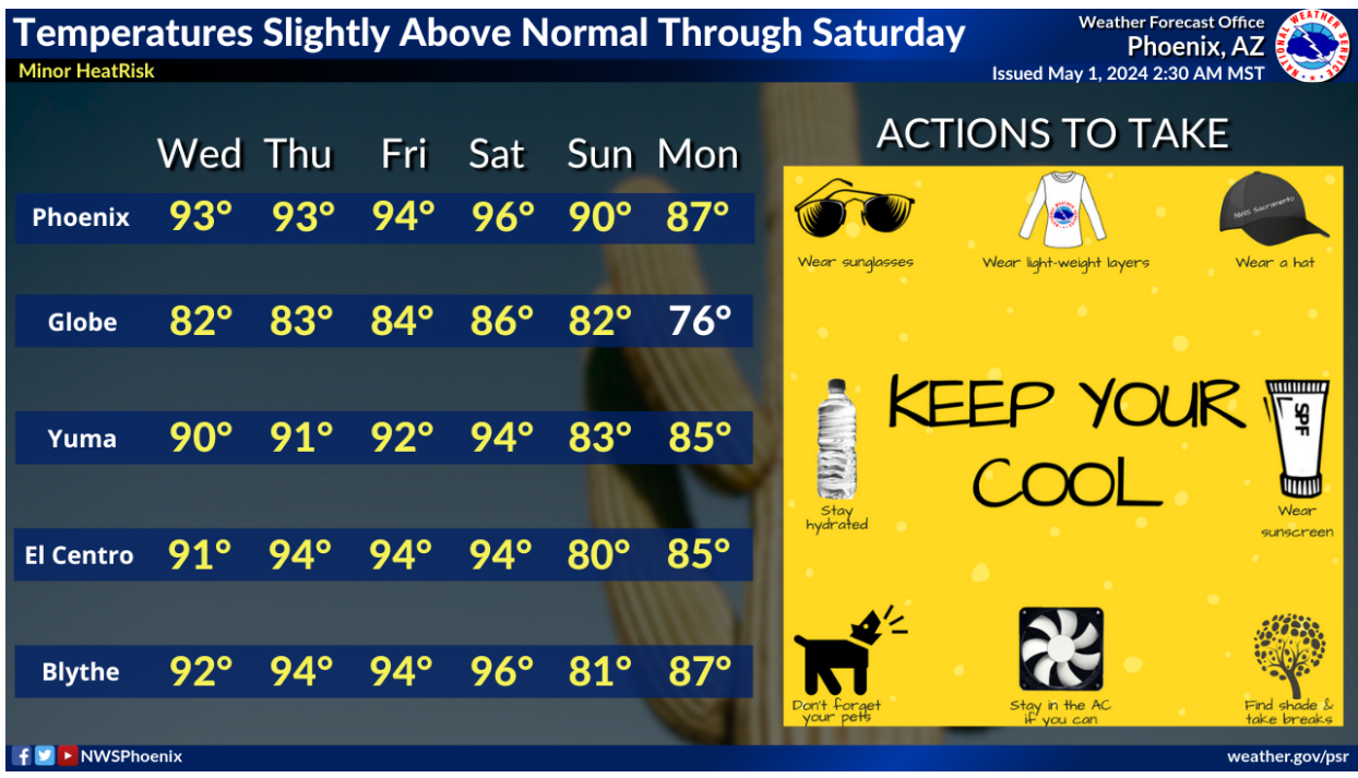
24-05-01 High Temp 6-day Forecast.png